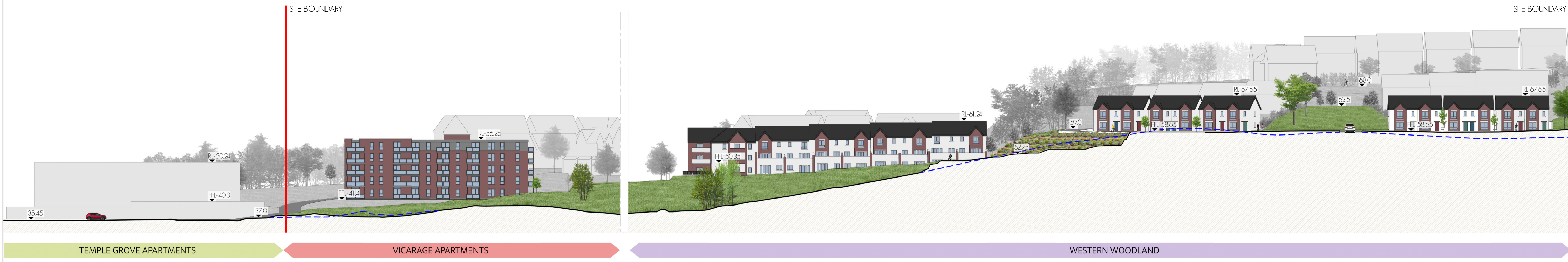
SITE SECTION A-A 1:500

THIS DRAWING IS FOR INFORMATIONAL & DISCUSSION PURPOSES ONLY. FURTHER DRAWINGS AND STUDIES WILL BE REQUIRED FOR CONSTRUCTION AND TO ENSURE COMPLIANCE WITH RELEVANT BUILDING REGULATIONS AND STANDARDS.