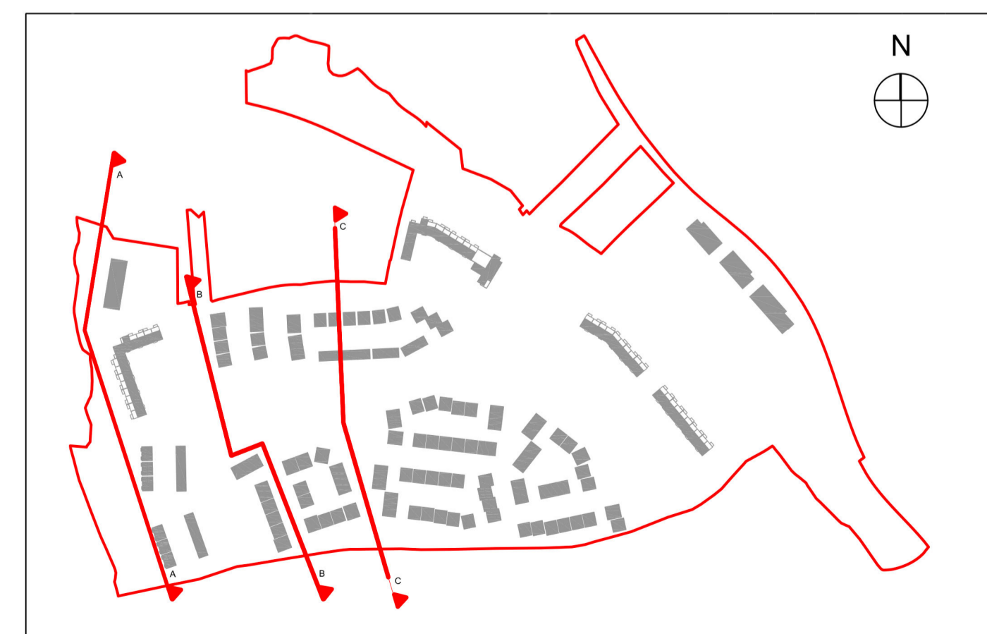
SITE KEY PLAN 1:5000